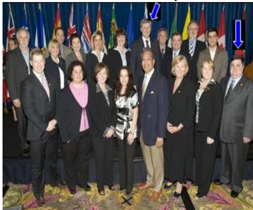
Prime Minister a guest at CREA PAC Days 2009 Both Prime Minister Harper and Finance Minister Jim Flaherty were guests at PAC Days 2009, held April 26-28 in Ottawa.